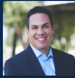
CD31 PETE AGUILAR