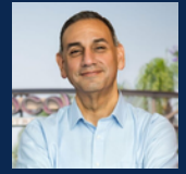
CD39 GIL CISNEROS